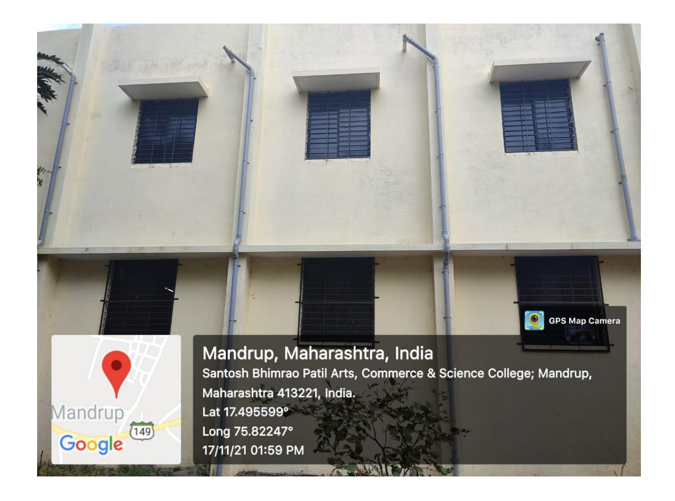
Rain Water Harvest System